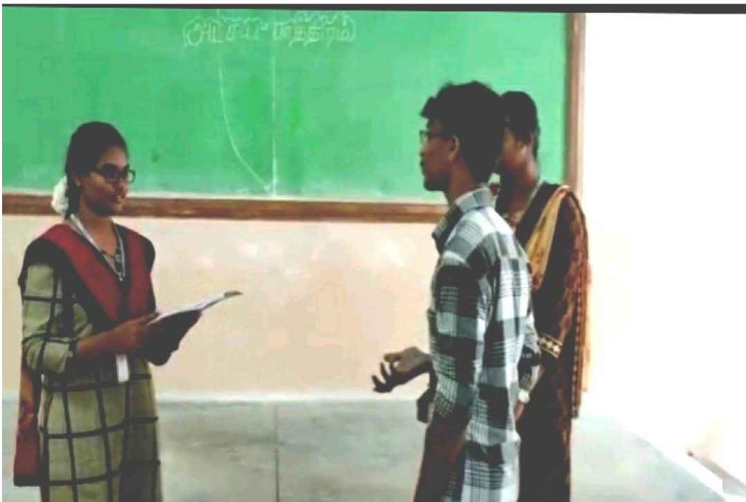
Participative Learning – Roleplay by B.Sc (Mathematics) Students