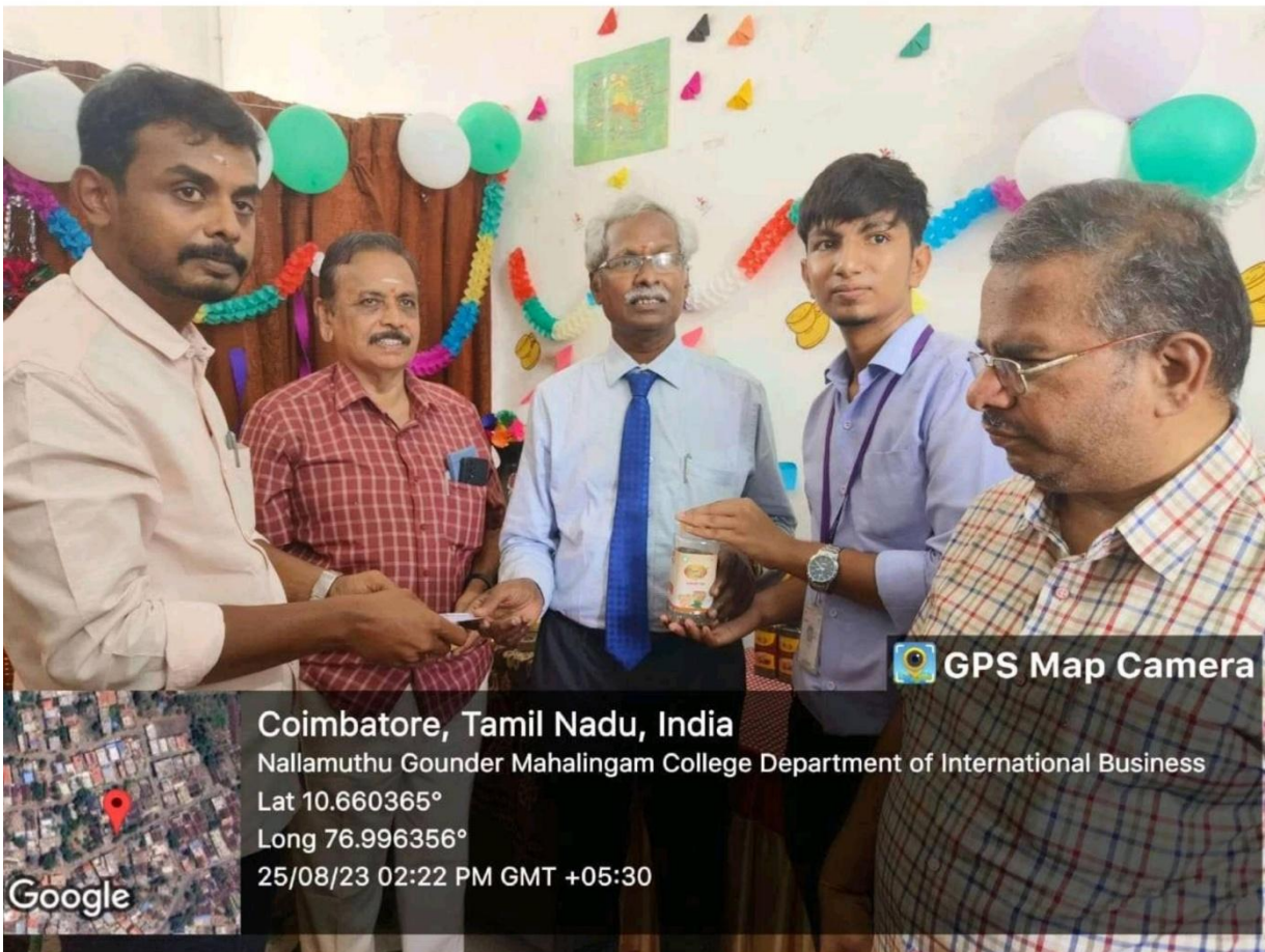
Sales at “Lychee Mart”