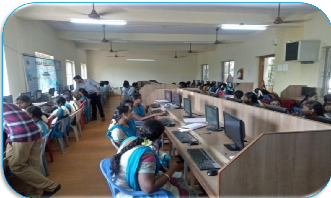
Laboratory Teaching and Experiential Learning by Students of Computer Technology Department