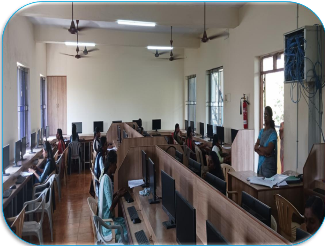
Laboratory Teaching and Learning by Department of Computer Science